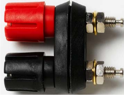
Model 6883 Dual Binding Posts