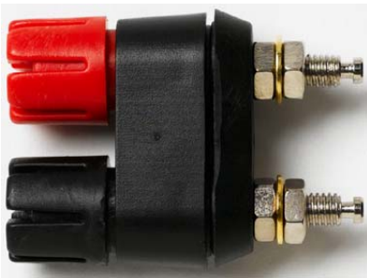
Model 6884 Dual Binding Posts with Raised Base