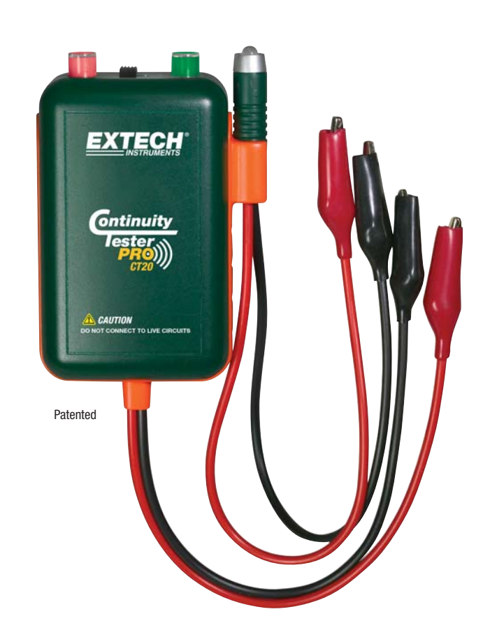
Continuity Tester includes Remote probe with bi-color LED for wire identification highlight