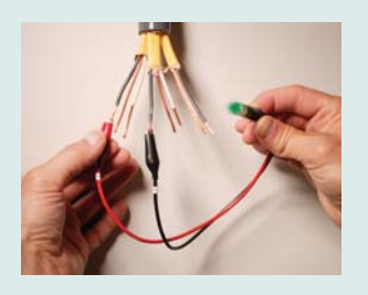
GREEN LED means wiring is properly identified.