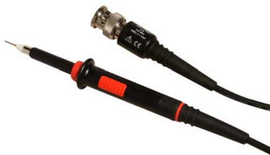
Model 6495 Modular Passive Oscilloscope Probe