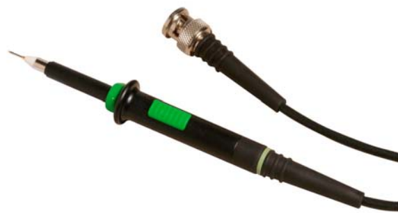
Model 6499 Modular Passive Oscilloscope Probe