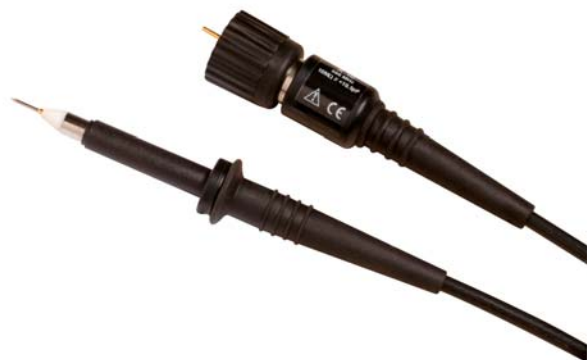
Model 6551 Microline Passive Oscilloscope Probe with Readout Actuator