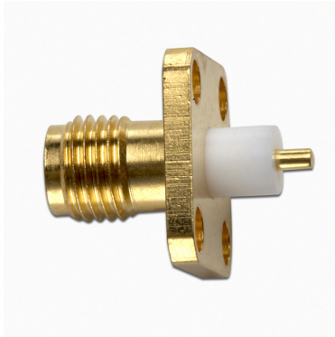
Model 72962 SMA JACK PANEL RECEPTACLE (4 HOLE)

High bandwidth, small size, and durability for confident connections