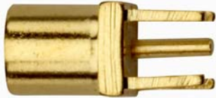
Model 73039 MMCX JACK STRAIGHT EDGE CARD

Snap-on coupling and micro-miniature size for fast connect and disconnect where space is limited