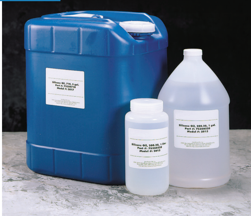
Fluke Calibration offers a wide variety of bath fluids in different container sizes.

Viscosity is a measure of a fluid's resistance to flow—we often think of it simply as "thickness." Kinematic viscosity is the ratio of absolute viscosity to density and is measured in "stokes" (at a specific temperature), which are commonly divided by 100 to give us more helpful "centistokes." The higher the number of centistokes, the more viscous (or thick) a fluid is. Viscosity is always stated at a specific temperature (often at 25 °C) and increases as the fluid's temperature decreases (and vice versa).