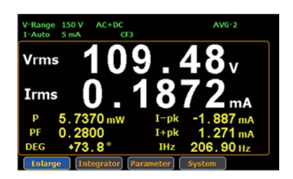
Low Current Range & High Resolution

For IEC 62301/EN 50564 standby power consumption test requirement, GPM-8213 can fully meet the demand by its features, including measurement frequency bandwidth of DC~6kHz, minimum current level of 5mA (resolution: 0.1uA), power measurement resolutions (1uW for minimum current and voltage levels; 1mW for maximum current and voltage levels). Beyond that, time resolution for integral measurement is one second.