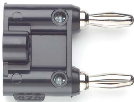
Model MDP, 4892, 4898 Stackable Double Banana Plug with Cable Guide