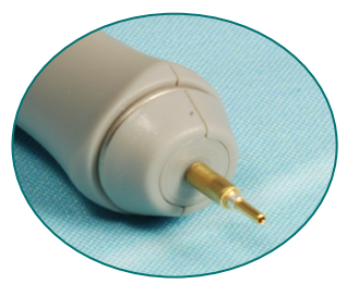
MCP-6 Probe Set with Coaxial Pins Installed

Replaceable Pin Options: P/N MCP-A (2 pins) Compatible with TEGAM R1L-B, R1L-BR, R1L-BR1, R1L-D1