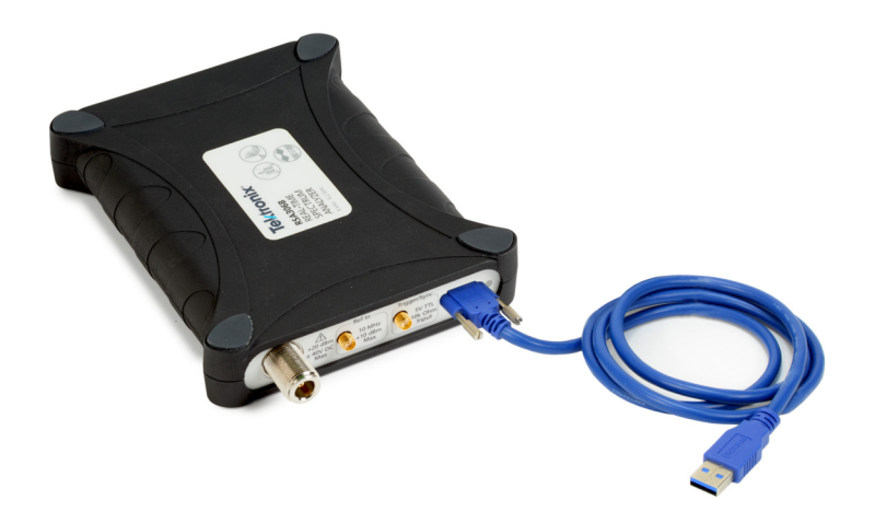
Figure 1: RSA306B Real-Time Spectrum Analyzer

The RSA306B and RSA306B-SMA are portable, 40 MHz Real-Time Spectrum Analyzers that contain an acquisition system inside a small module. The user interface and display resides on a user-provided PC running SignalVu-PC software or a user-developed application. The host PC provides all power, control, and data signals over the USB 3.0 cable included with the instrument. An available software application programming interface is provided to allow you to create your own custom signal processing application.