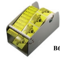
B6702 Label dispenser