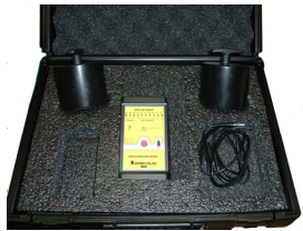
B8562KIT with B8562 meter, 2 leads, 2-5lbs weights and case