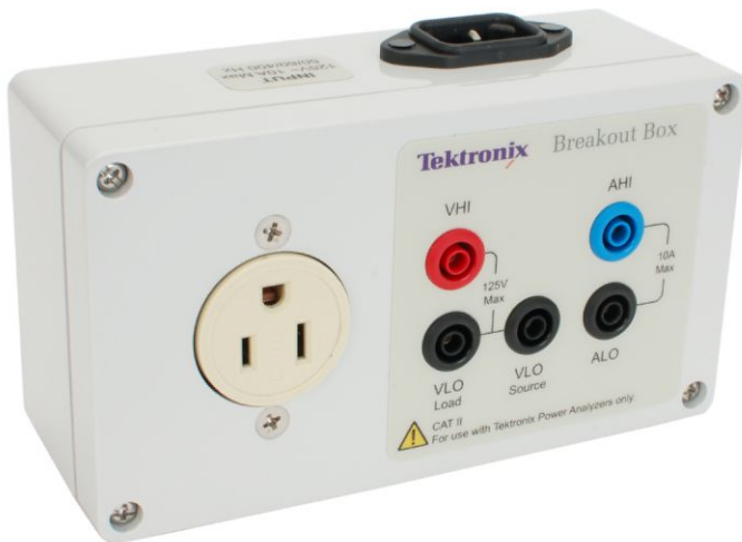
BB1000-NA Breakout Box