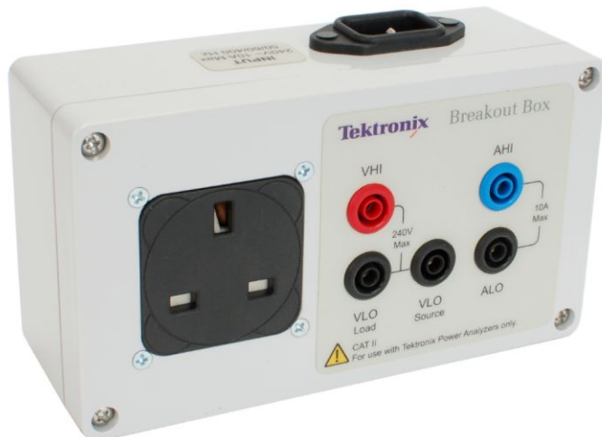
BB1000-UK Breakout Box

The BB1000 Breakout Box makes wiring connections between your device-under-test and Tektronix power analyzers easy and safe, by 'breaking out' the current flow for connection to the internal current shunt in the analyzer. It provides a line output socket to power your device under test (up to 10 A RMS ) and 4 mm sockets for direct connection to the Tektronix power analyzer terminals. The BB1000 Breakout box is offered in three different versions with these receptacle styles: