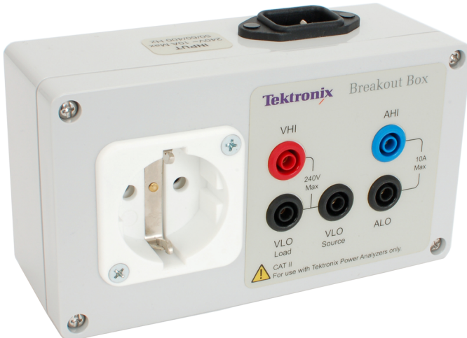
BB1000-EU Breakout Box