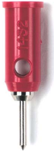
Model 1432 Banana Jack to Pin Tip Plug