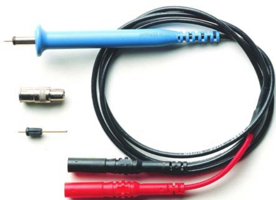
Model 6106 DMM RF Detector Test Probe