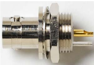
Model 6741 BNC (F) Bulkhead, Isolated ground