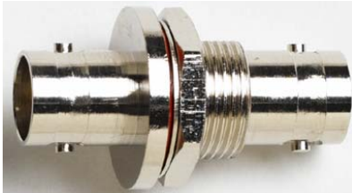
6744 BNC (F/F) Panel Mount Hermetically Sealed-75 Ω