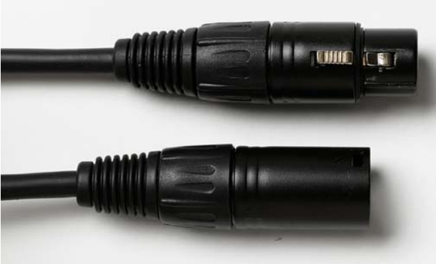
Model 6869-180*, -300*: XLR Plug/Jack Cable 15 feet, 25 feet