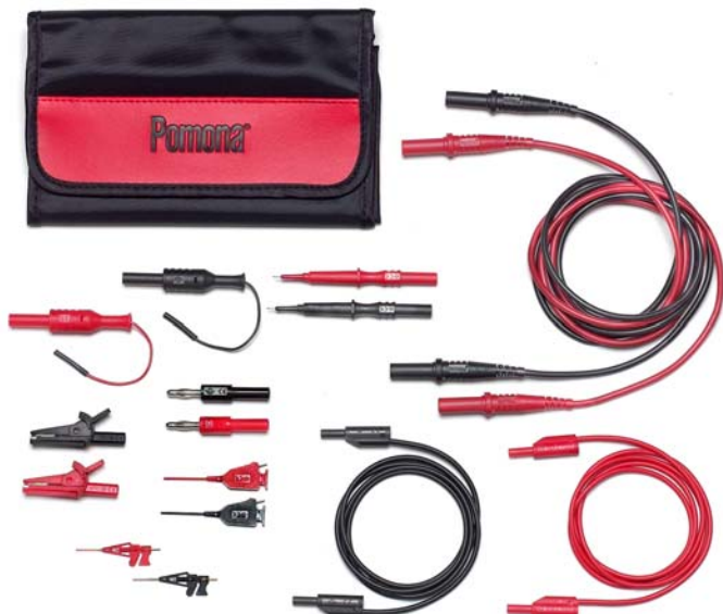
Model 72928 SMD Multi-Use Test Kit

Everything you need for SMD Test with your DMM in one kit