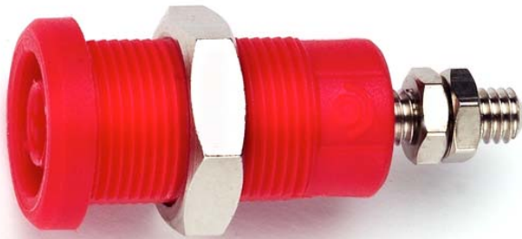
Model 72930 Panel Mount IEC 61010 4mm (0.16in) Jack for Sheathed Plugs