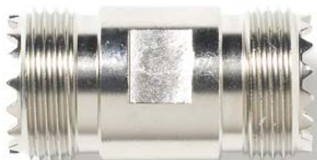
Model 73058 UHF Jack to Jack Adapter