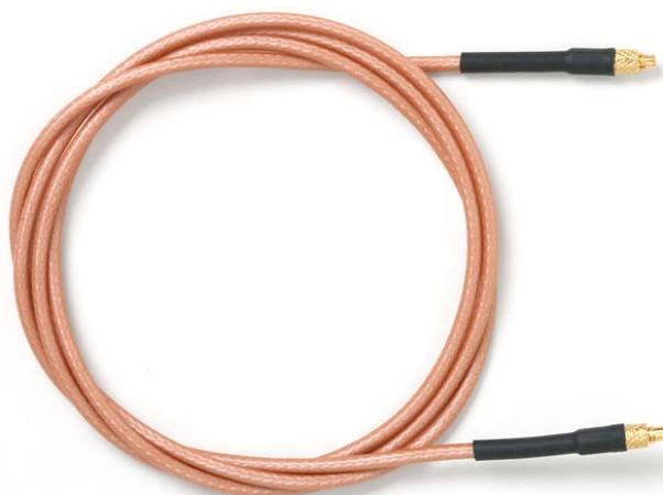
Model 73063 MMCX Plug to MMCX Plug, RG316/U

Snap-on coupling and micro-miniature size for fast connect and disconnect where space is limited