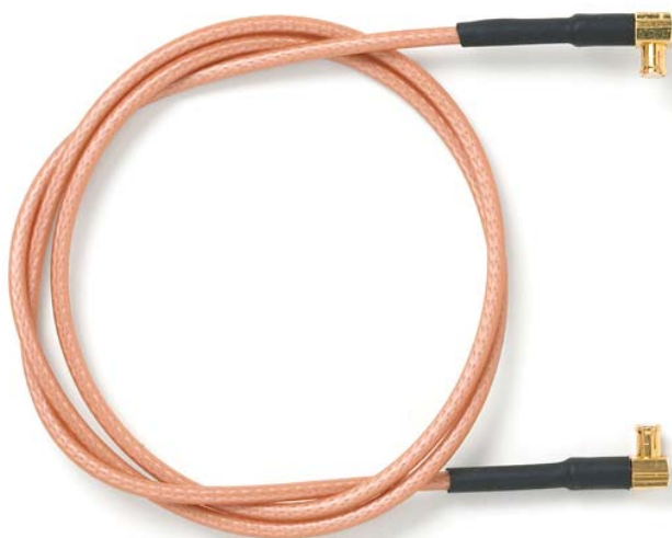
Model 73068 MCX Right-Angle Plug to MCX Right-Angle Plug, RG316/U

Snap-on coupling and miniature size for fast connect and disconnect where space is limited