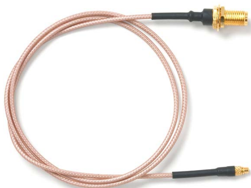
Model 73078 MMCX Plug to SMA Bulkhead Jack, RG178B/U

Small size, and durability for confident connections