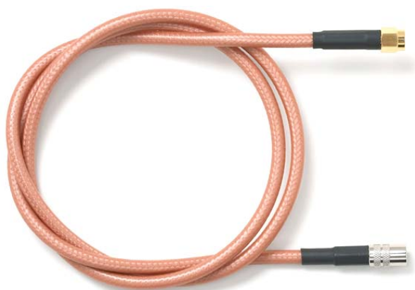
Model 73082 SMA Quick-Connect Plug to SMA Plug, RG142B/U

Small size, and durability for confident connections