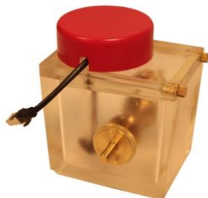
Test Cell: TCVDE ASTM D1816 (pictured left)