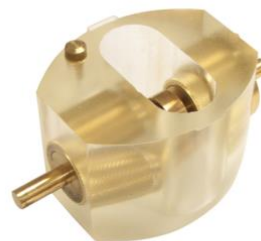
Test Cell: TCDE ASTM D877 (pictured left)