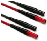
196-3523-00: Extender Leads (1.5 m).